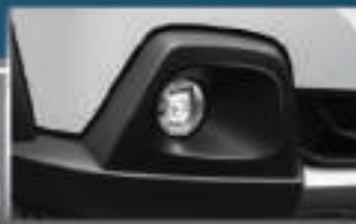
BOLD FOG LAMPS