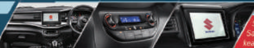
STUNNING CARBON FIBERED PATTERN DASHBOARD