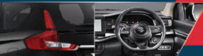
BOLD LED REAR COMBINATION LAMP WITH LIGHT BLENDS**

Memiliki semua fitur Zeta dilengkapi fitur extraordinary yang akan membuat pengalaman berkendara lebih menyenangkan.