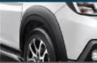
MUSCULAR WHEEL ARCH EXTENSION