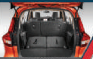
SPACIOUS LUGGAGE BOARD 60:50 SPLIT