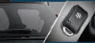
REAR WINDOW DEMISTER***