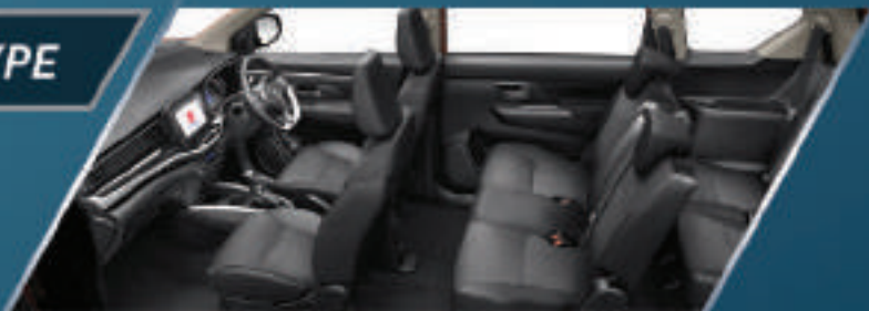
SPACIOUS CABIN WITH BLACK INTERIOR COLOR

Dilengkapi berbagai fitur-fitur extraordinary SUV yang akan membuat perjalanan semakin nyaman, aman, dan penuh gaya.