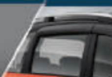
STUNNING DOOR VISOR**

Memiliki semua fitur tipe Beta plus fitur - fitur extraordinary yang hanya tersedia secara eksklusif untuk tipe Alpha.