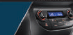
SMART AC DIGITAL AUTO CLIMATE WITH HEATER***