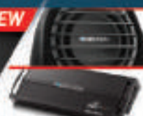
JSP SOUNDSTREAM 6-CD & SURROUND SPEAKER SYSTEM 10 INCH + BOX*