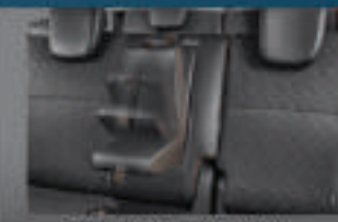
COMFORTABLE 2ND ROW CENTER ARM REST