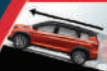
HILL HOLD CONTROL (HHC)***