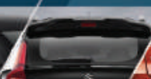
STUNNING REAR UPPER SPOILER**