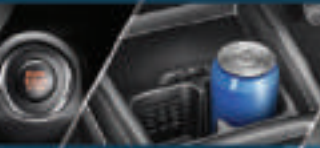
SMART KEYLESS & ENGINE PUSH START STOP BUTTON***