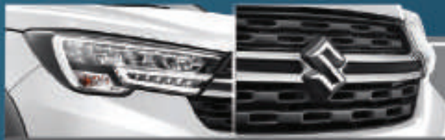
BOLD LED HEADLAMP WITH DRL (AUTO ON)