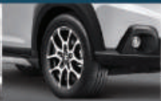
BOLD BLACK POLISHED ALLOY WHEEL 195/60R16