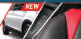
BLACK & RED ACCENT BODY COLOR*