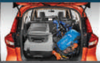
SPACIOUS LUGGAGE SPACE