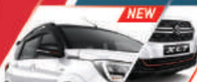
BOLD TWO-TONE COLOR*

Memiliki semua fitur tipe Alpha plus fitur-fitur extraordinary untuk pengalaman berkendara yang semakin impresif dan penuh gaya.