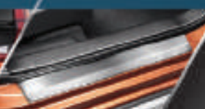
MUSCULAR DOOR SILL GUARD**