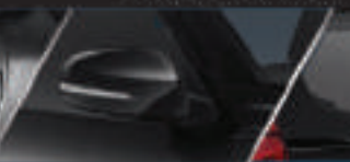
ELECTRIC FOG LAMP*** & ADJUSTABLE OUTSIDE MIRROR HEATER