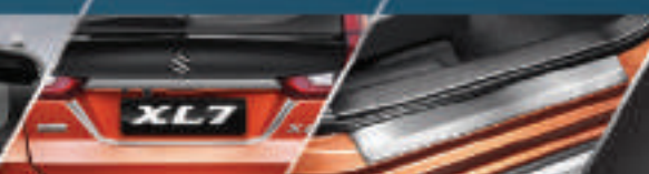
BOLD NUMBER PLATE GARNISH CHROME**